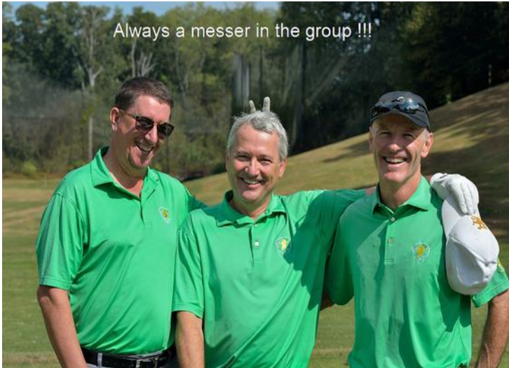
Always a messer in the group !!!