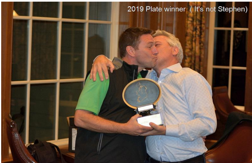
Plate Winner :